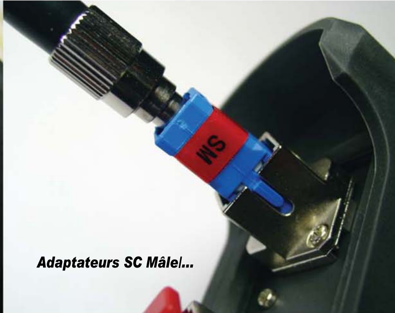
Adaptateurs SC Mâle...